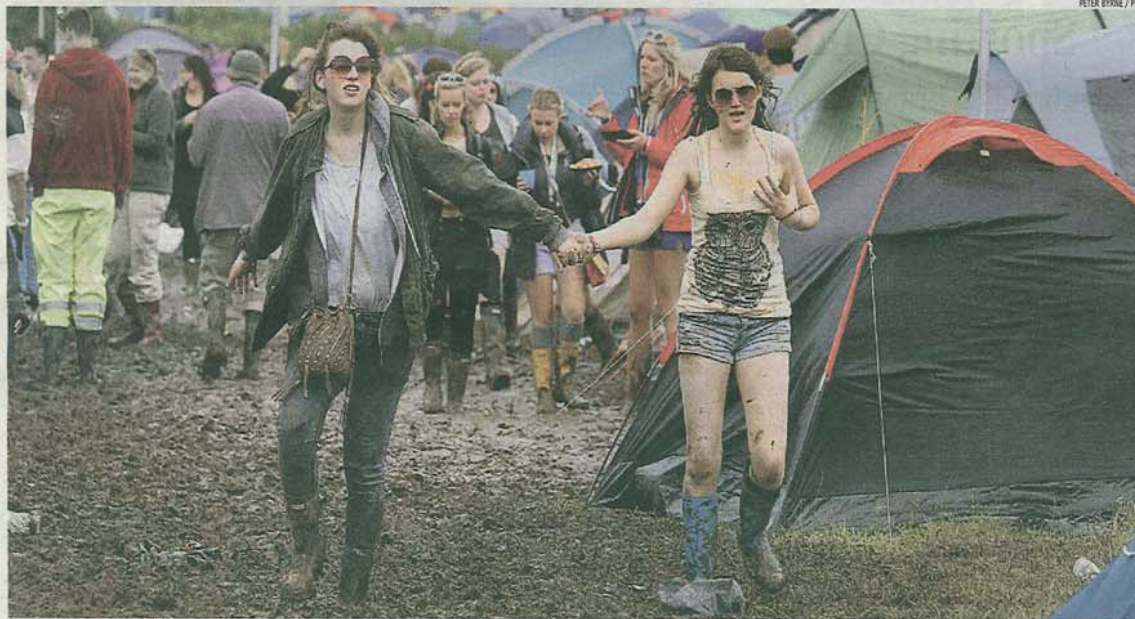
Flooding at the Isle of Wight Festival created a mudbath. Car-loads of music fans were pulled to safety by tractors and others gridlocked for up to ten hours. Page 11